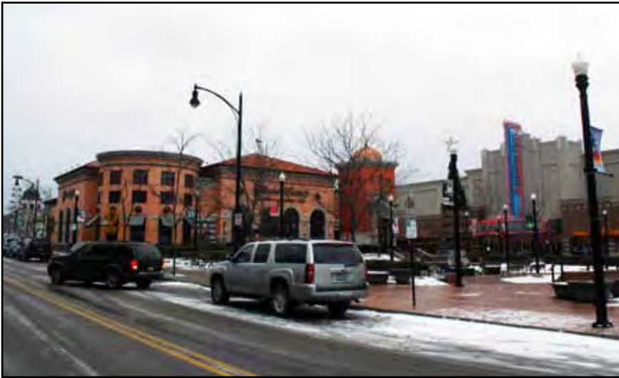
Figure 5: South Side Works, Pittsburgh