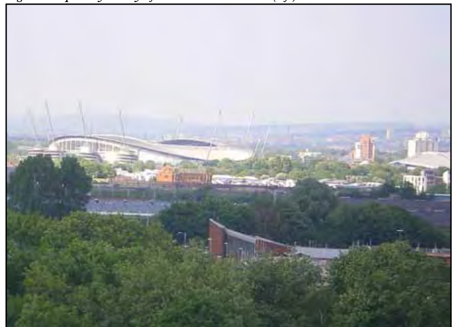
Figure 3: Sportcity – City of Manchester Stadium (left)

related facilities will include leisure, retail and hotel uses, and future potential for other commercial uses. It also includes a district centre