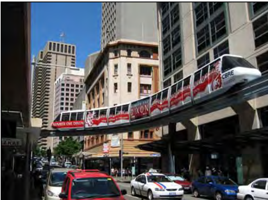
Figure 6: Sydney Monorail