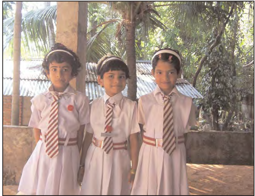
Figure 3: Kerala, India – 91% literacy rate

particularly to the rural, less accessible poor. Furthermore, within diverse social, cultural and religious backgrounds, changing approaches towards empowerment are also needed. For example, contemporary research suggests both men and women preferred going to persons of the same age, sex and social class as themselves in order to access contraceptives and advice on family planning. Raising the age of marriage, as in China, and removing any lingering pressure of sterilisation targets, are also noteworthy for consideration by state authorities.