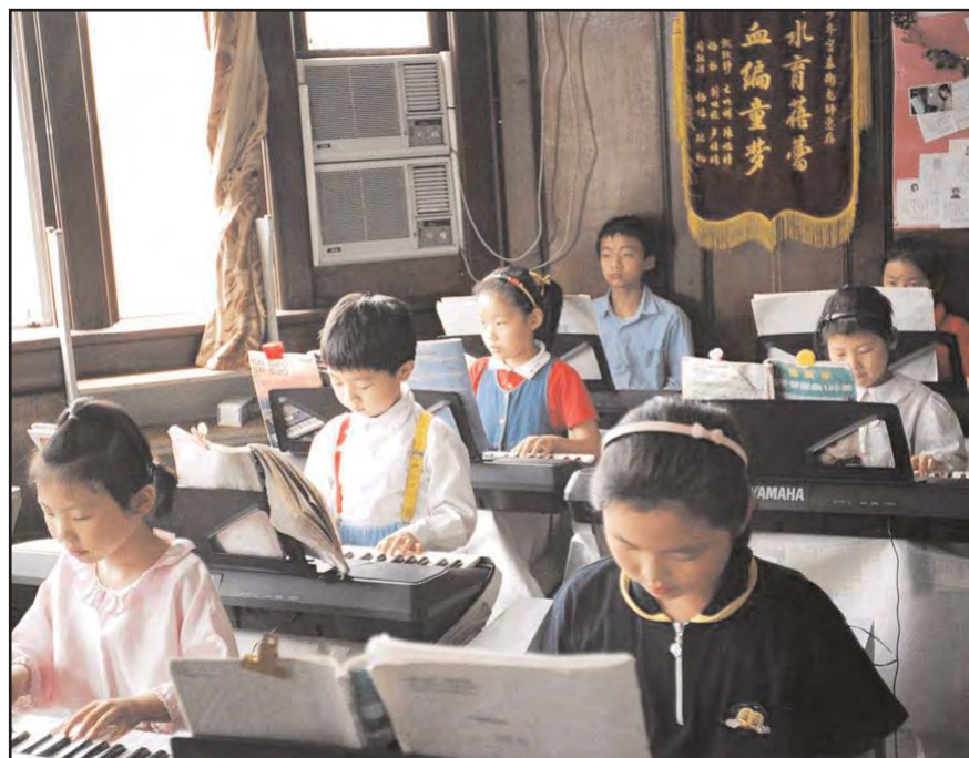
Figure 1: Beijing, China - priority education for the first child

low – labour costs. Population, therefore, is central to understanding China's significance in the world today.